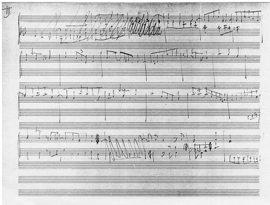
56. faksimile, A-dúr vonósnégyes (op. 7) — A III. tétel folyamatfogalmazványának első megfogalmazása (OSZK, Ms. Mus. 3.275)