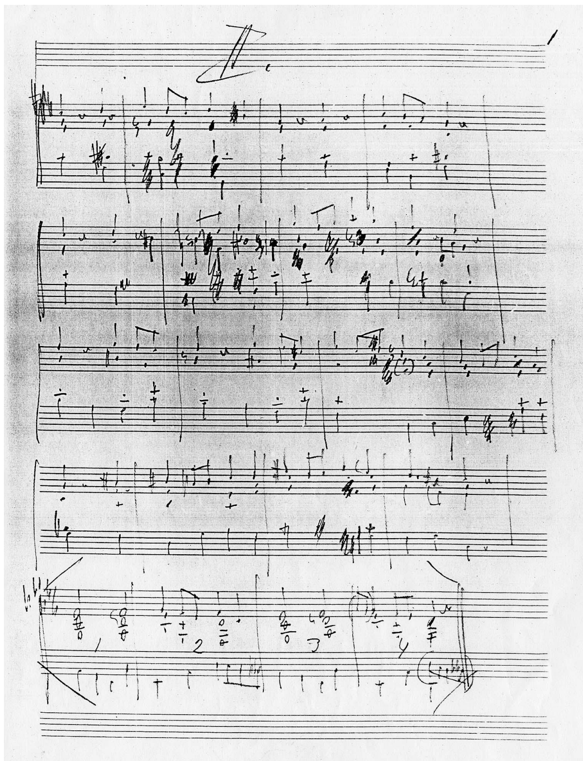
44. faksimile, A-dúr vonósnégyes (op. 7) — A II. tétel témája a refrénnel, (def. 1-24), (OSZK, Ms. Mus. 3.275, fol. 25 r )