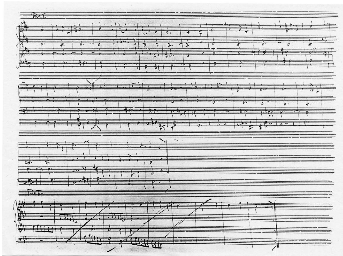
46. faksimile, A d-moll menüett Trio II elvetett első megfogalmazása — utolsó szisztéma (OSZK, Ms. Mus 3.275)